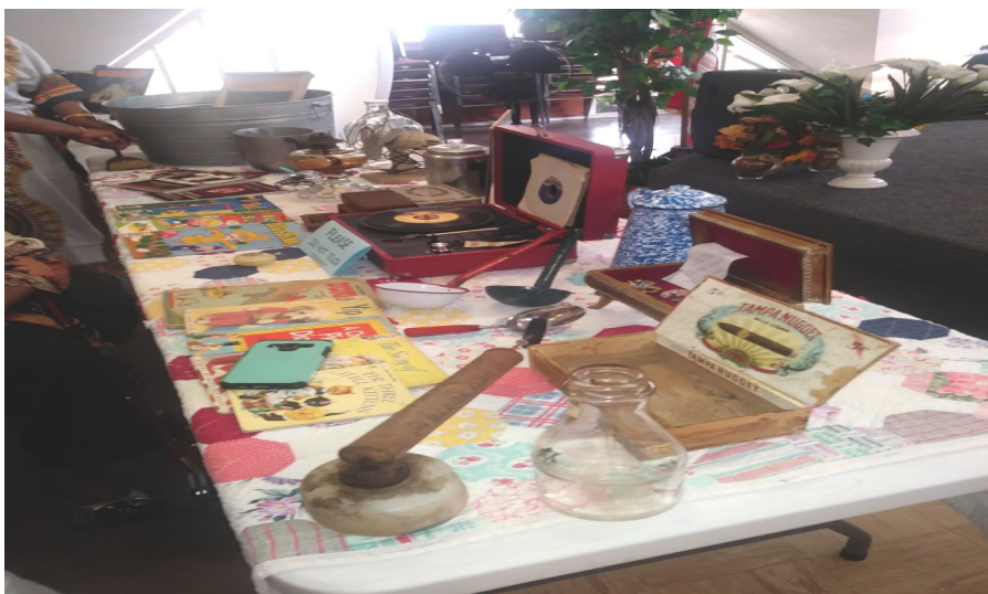
Articles from the past bringing back memories.